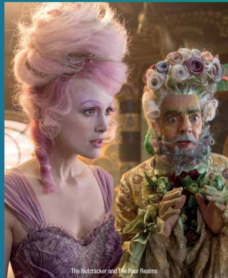
The Nutcracker and The Four Realms