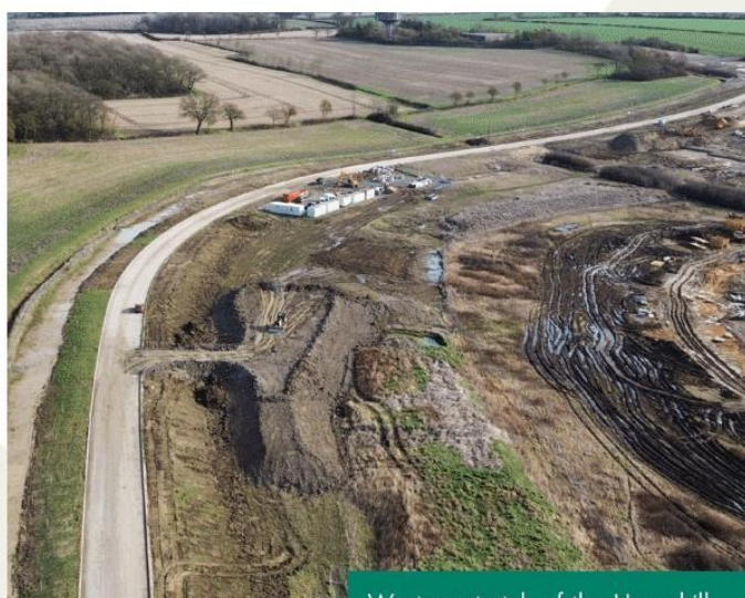
Western stretch of the Haverhill Relief Road - February 2025

Discussions have taken place with West Suffolk Council with a view to the Council adopting them and setting up an allotment Association.