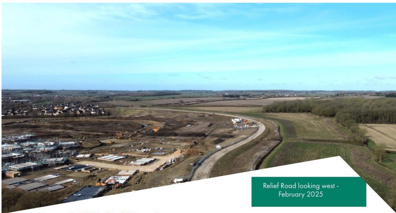
Relief Road looking west - February 2025