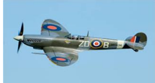
A photograph of a Spitfire.

As you can see, I clearly had no idea where it was but still feel it important to share this moment with you.